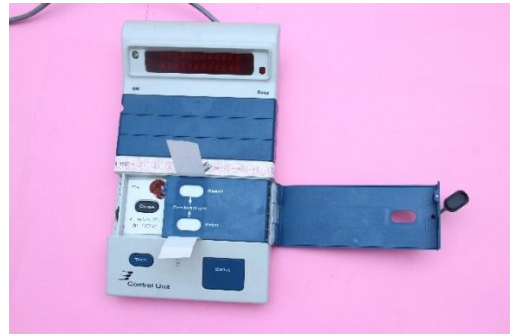
Sealing inner Result Section with Special Tag