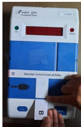
Affixing Green Paper Seal