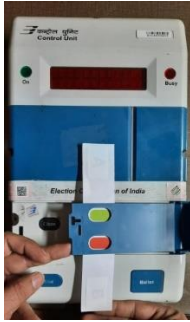
Fixing Green Paper Seal