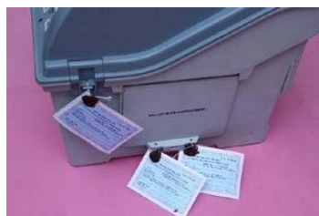
Sealing of Drop Box of VVPAT with Address Tag